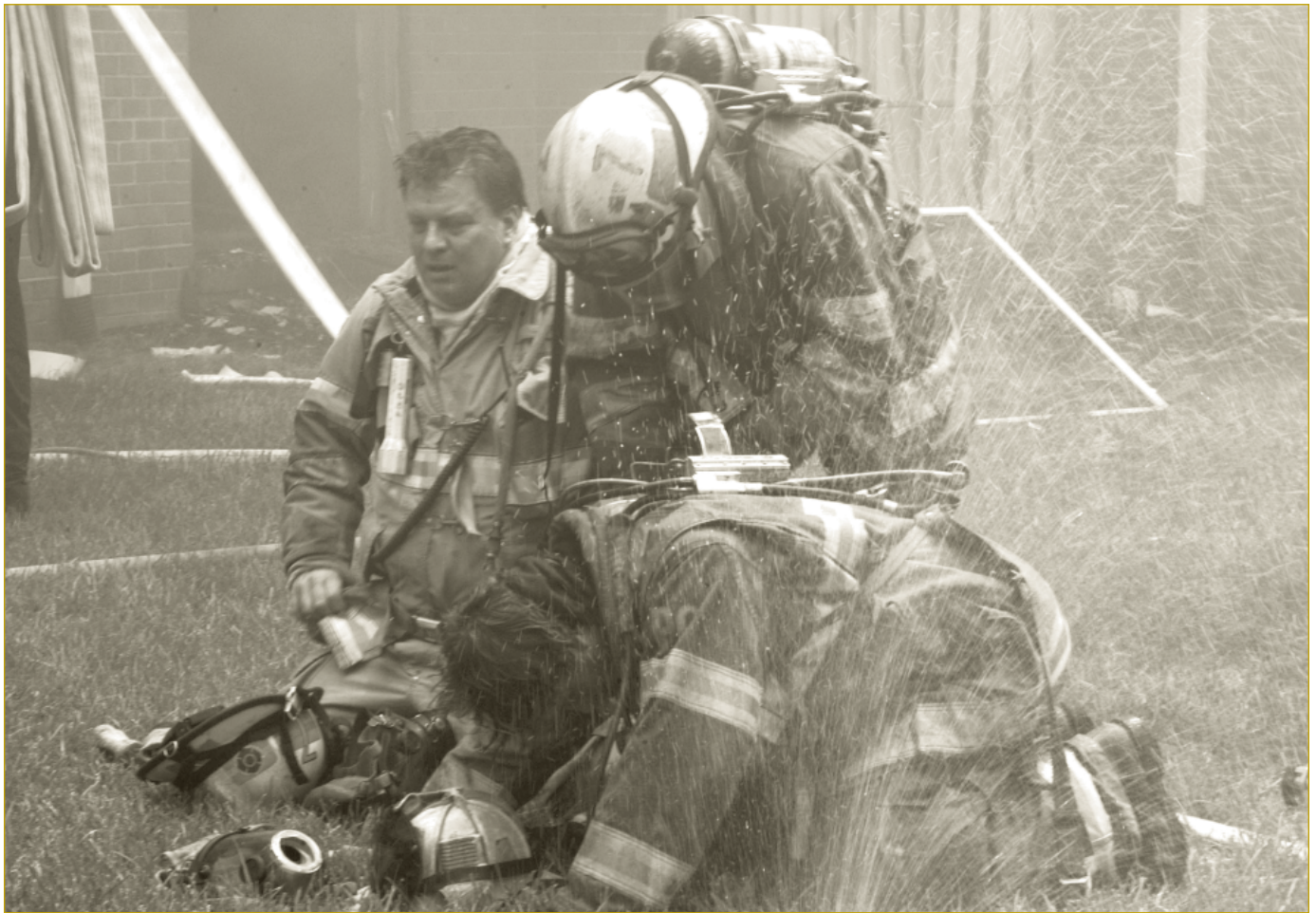
Top Left: Firefighters suffer the aftereffects of fighting a fire. Photos top right: A fire at an abandoned house in College Park. Bottom right: Ladder Truck 32 in action.