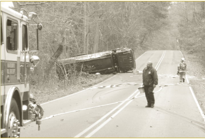
An overturned oil tanker.

timely and effective departmental response to traffic-related calls for emergency medical service. 12 Mass transit stations also pose special problems for the department because of the logistics and operational demands involved in fighting fires and responding to a medical emergency underground.