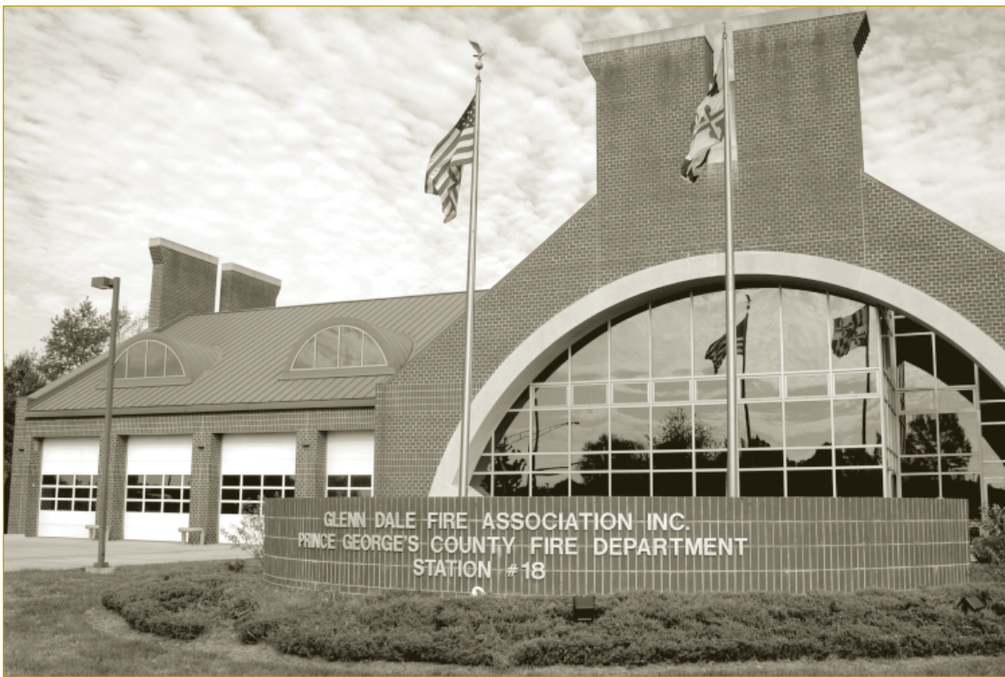
Glenn Dale Fire Station—Co. 18 (see previous page for details).