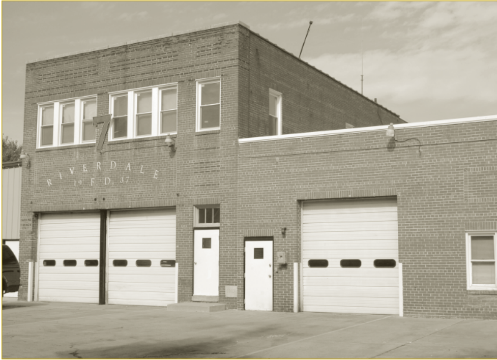
Left: Riverdale Fire Station—Co. 7. Below: Bunker Hill Fire Station—Co. 55.