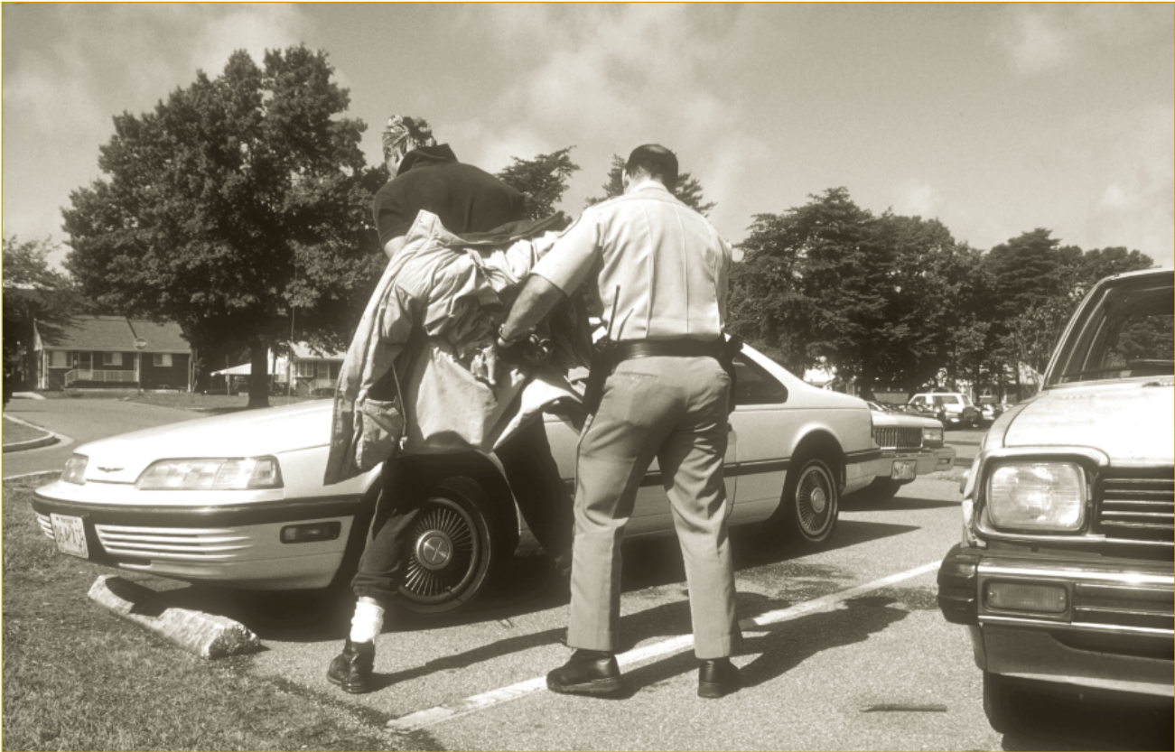
M-NCPPC Park Police secure and protect over 23,000 acres of park property in Prince George's County through the prevention of crime and apprehension of criminals.