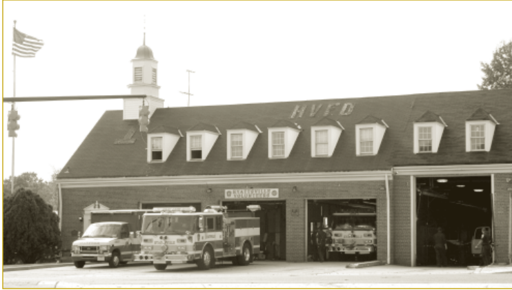
Hyattsville Fire Station—Co. 1.