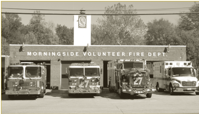
Morningside Fire Station—Co. 27.