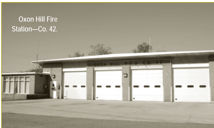
Oxon Hill Fire Station—Co. 42.