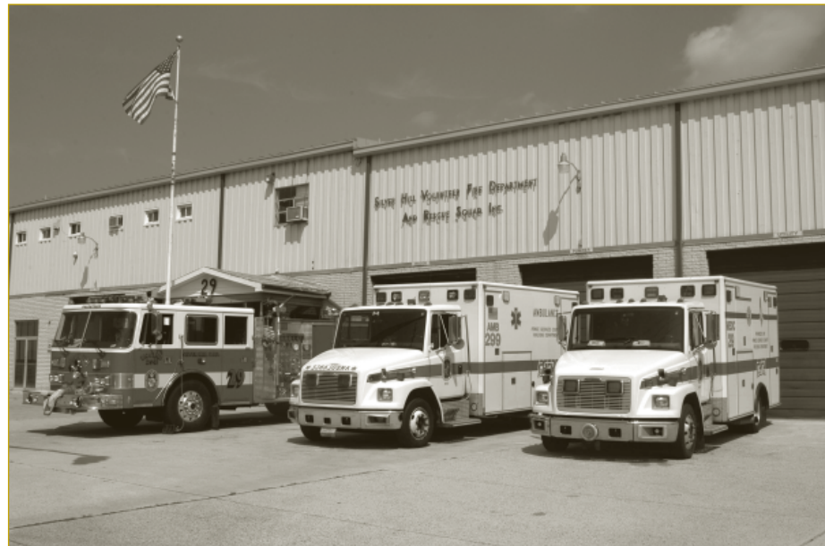
Silver Hill Fire Station—Co. 29.