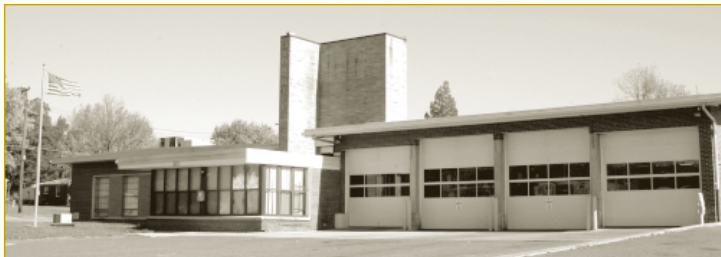
Oxon Hill Fire Station—Co. 21.