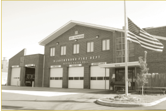
Bladensburg Fire Station—Co. 9.