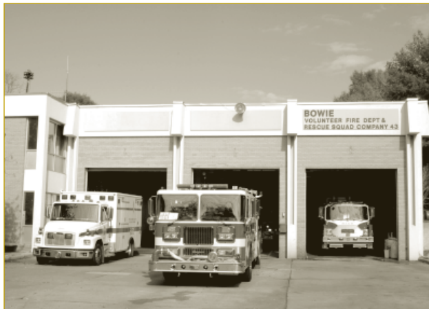
Bowie Fire Station—Co. 43.