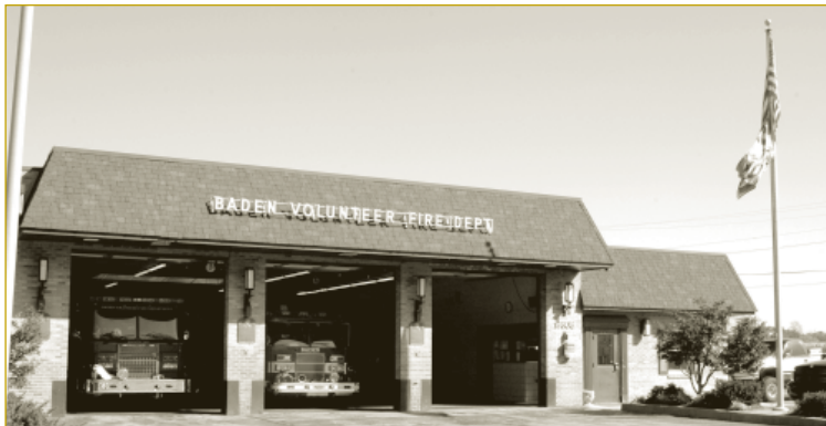
Baden Fire Station—Co. 36.