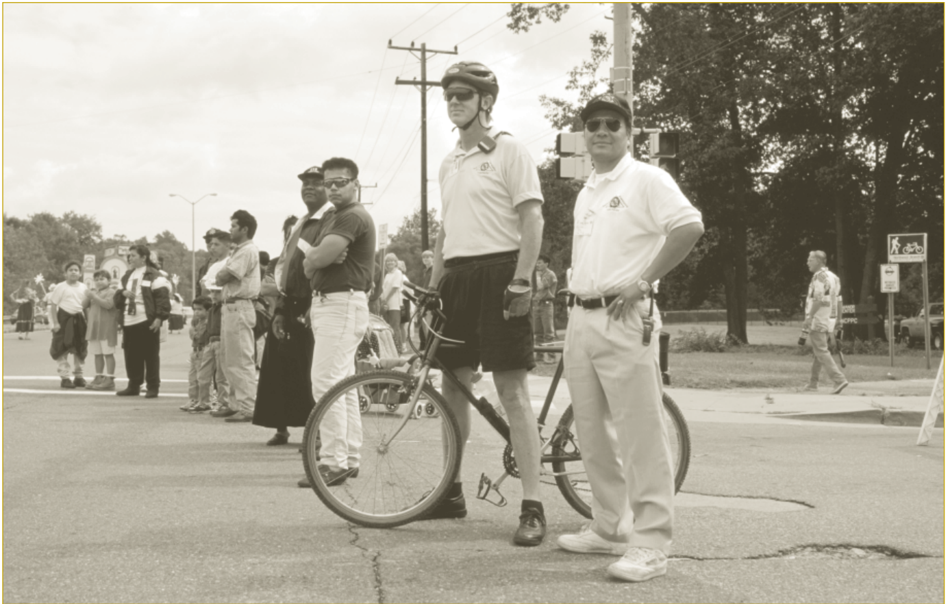
M-NCPPC photos pages 37–40.