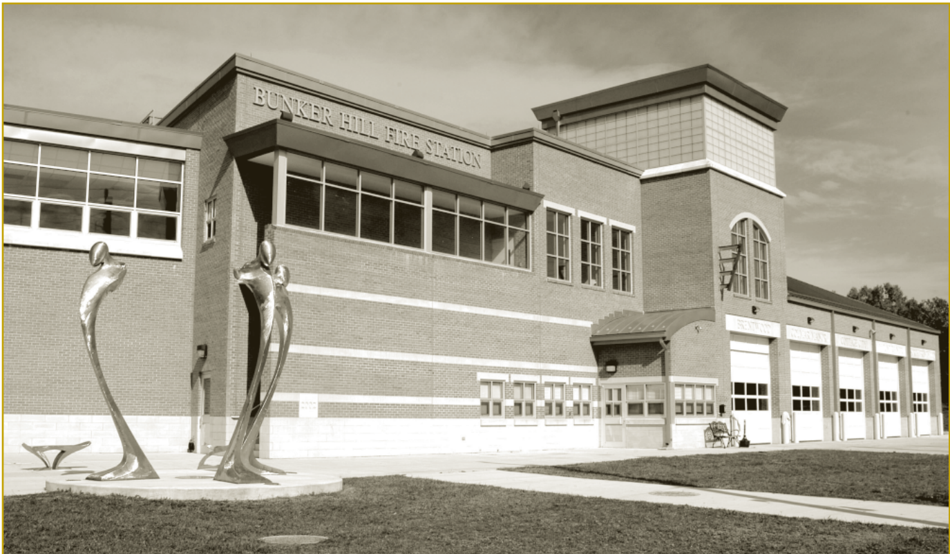
Bunker Hill Fire Station—Co. 55.

This preliminary master plan recommends a guideline for Fire/EMS station size in order to provide a model prototype that can be modified to fit the individual needs of the community in which it is being constructed. Station sizes will vary by function and vehicles housed. The typical prototype station should be designed for three bays and hold a suppression vehicle and an EMS unit (paramedic ambulance or medic unit), with one bay for storage and backup. Station bays can be designed to accommodate 4, 5, or 6 vehicles. The number of suppression units and EMS units housed can vary, depending upon the location of the station and the land use characteristics around it. The table on the following page describes a prototype three-bay, double deep facility to house four vehicles.